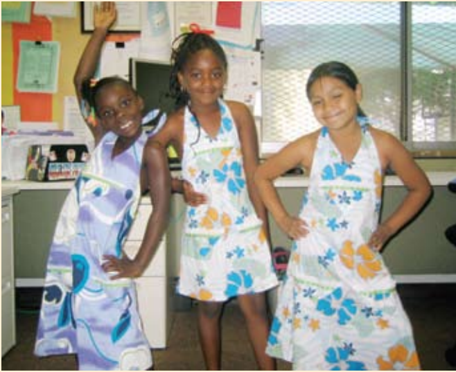
SAGE children try out their runway walks with fashion from long time supporter HEIR Apparel.