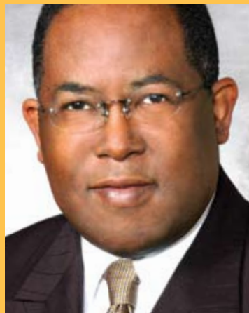
California State Senator