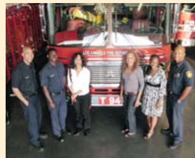
Happy faces on the winners of one of our auction items: lunch with local firemen at the station. Scorching!

Get your dancing shoes and your checkbooks ready. On Saturday, June 21 , we will be dancing for dollars to support Crystal Stairs.