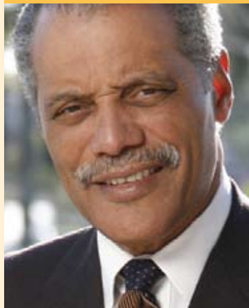
Los Angeles City Councilman

The responses provided do not reflect the position of Crystal Stairs. These are the words of the candidates.